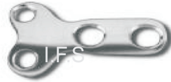
SCI - MFI: 102